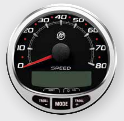
SC1000 Speedometer Available in black, white and gray