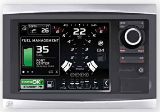
VesselView 7 monitors up to four engines