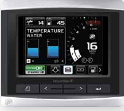
VesselView 4 monitors up to two engines

Ask your Mercury dealer for additional information and to help customise the right SmartCraft system for you.