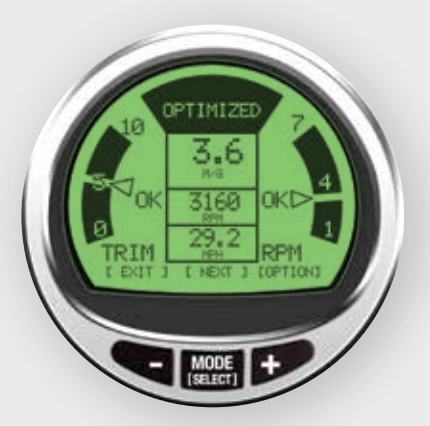
MercMonitor displaying ECO-Screen

Mercury SmartCraft gauges provide instant, reliable information at a glance. Combined with additional sensors, Mercury's digital gauges are powerful tools to provide safety and comfort on the water.